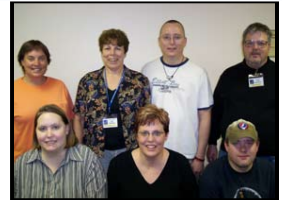
Survivors Group Council Members